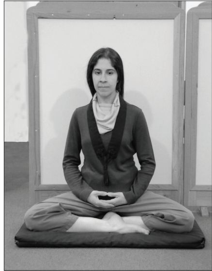
Meditation in the Burmese position

To sit in the half-lotus position, place one foot in front of you, the bottom of the foot touching the bottom of the opposite thigh and the other foot on the opposite thigh. In the full-lotus position each foot is