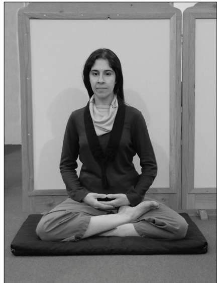
Meditation in half lotus