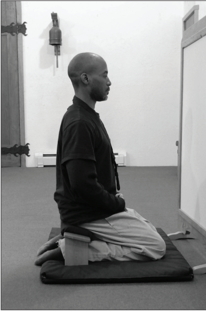
Meditation on a bench