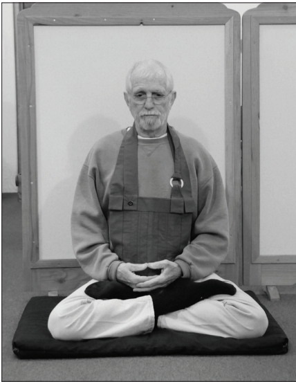
Meditation in full lotus

it is essential to get your posture checked at a meditation group meeting, or at one of our priorities or retreats before too long.