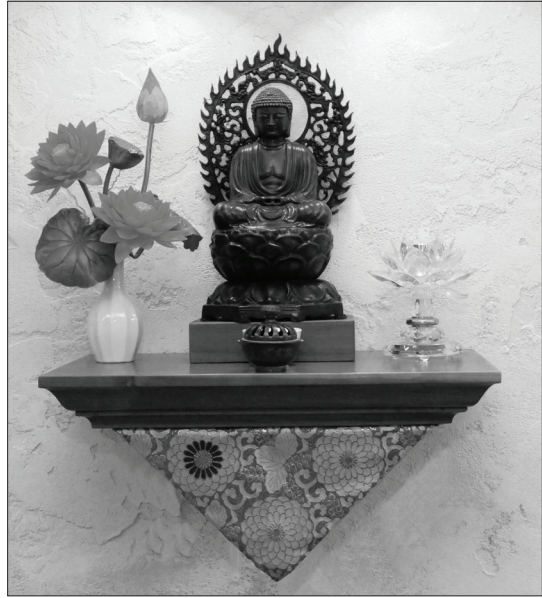
Guest office altar at Shasta Abbey

shelf or a specially-made altar cabinet. A statue or picture of a Buddha or some aspect of the Unborn, such as Great Compassion (Avalokiteshwara Bodhisattva), Great Love (Samantahadra Bodhisattva) or Great Wisdom (Manjusri Bodhisattva) is placed in the center at the back. To symbolize the blossoming of enlightenment, flowers are placed to the left of the statue and, out of concern