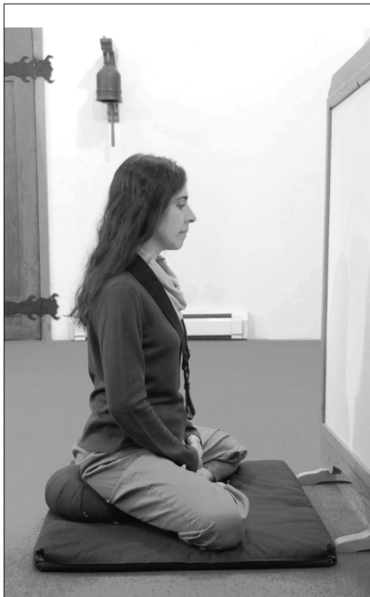
Meditation on a cushion

Another position is the kneeling posture with a meditation bench. The bench has a forward-sloping seat that supports the buttocks and prevents the ankles from being crushed or the knees being strained. The legs of the bench should only be long enough to allow the ankles to fit underneath the seat. Too high a bench, or one with too steep an angle, exaggerates the curve of the lower back and causes pain. Some people find that their arms are not long enough to rest comfortably in their lap when using a bench, a problem that is easily solved by placing a small cushion under the hands.